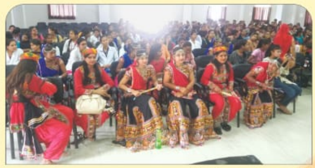
सांस्कृतिक कार्यकम प्रस्तुतिकरण की तैयारी करती छात्राएँ