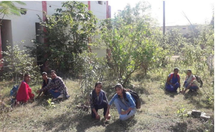
Tree Plantation to save the Environment