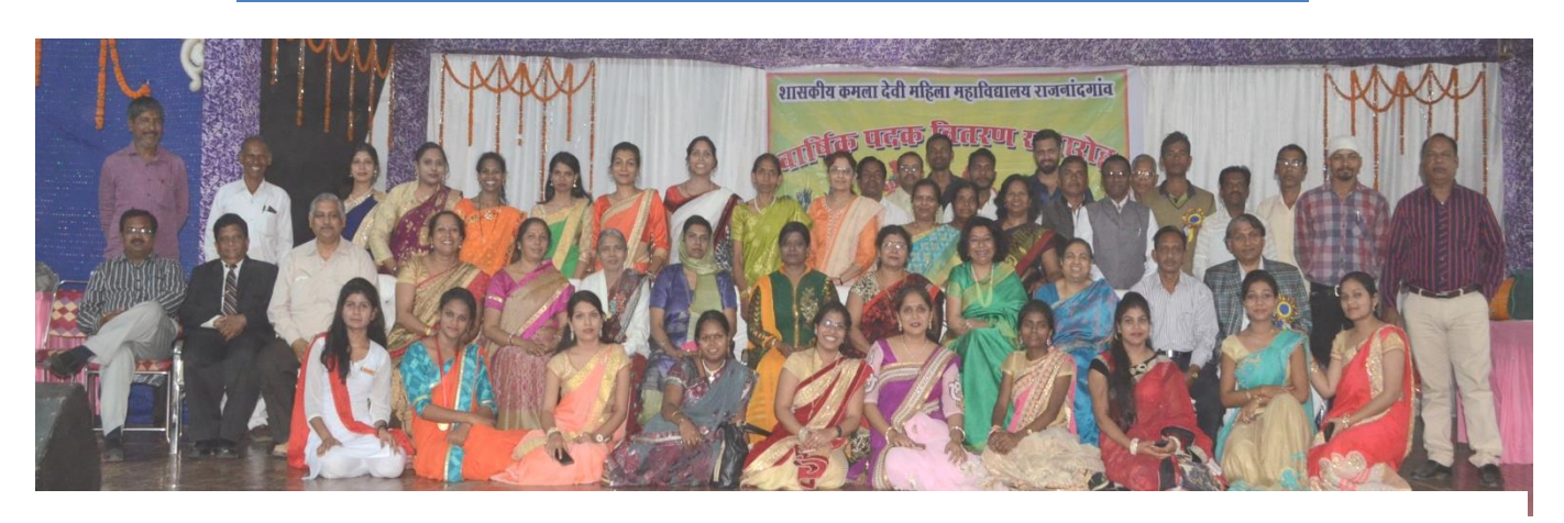
Annual Prize Distribution