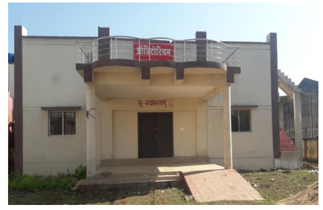
New RUSA Building New Auditorium