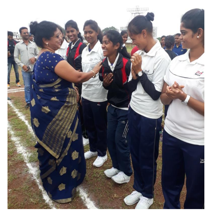
District Level Kho-Kho Runner