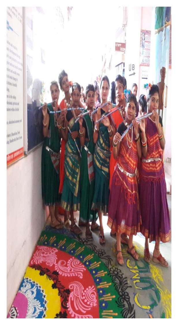
Annual Function 2017-18