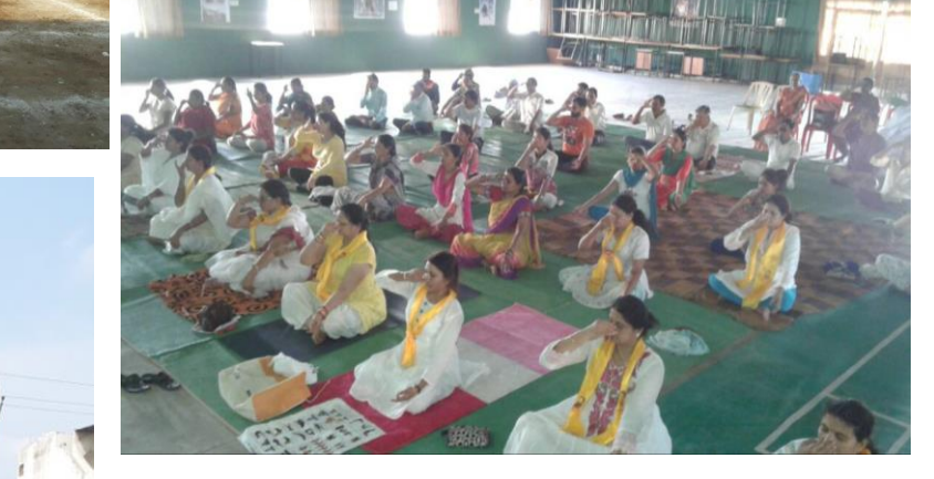
International Yoga Day