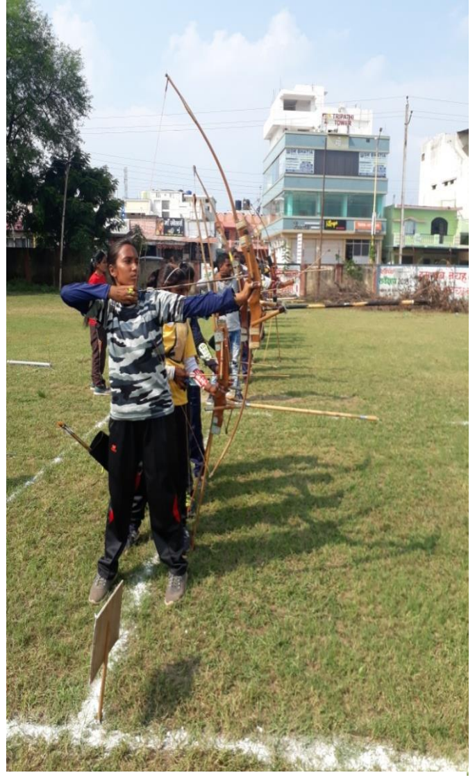
Inter-College Winner: Archery